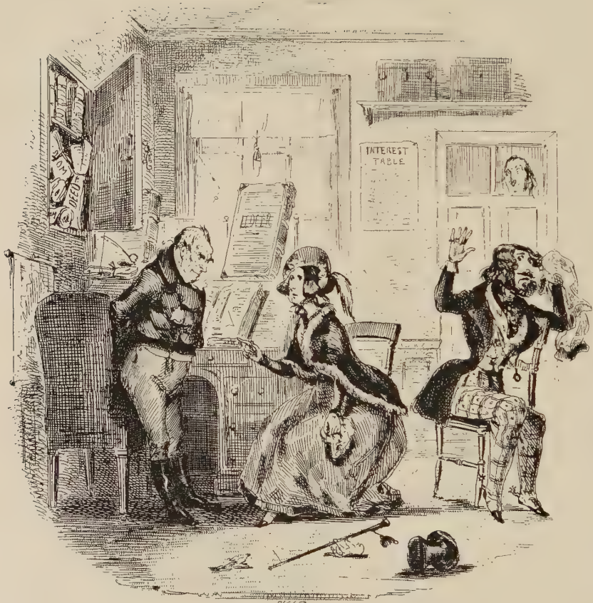
MR. AND MRS. MANTALINI IN RALPH NICKLEBY'S OFFICE.